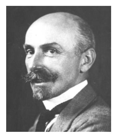
Ambrose Goddard Hesketh Pratt

Australian author of mostly historical novels, some 30 in all, plus numerous non-fiction books, and a handful of short stories.