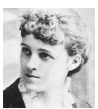
Celebrated prolific American author of "The age of Innocence", and much more, including some 85 short stories.

IT had been almost too easy— that was young Millner's first feeling, as he stood again on the Spence door-step, the great moment of his interview behind him, and Fifth Avenue rolling its grimy Pactolus at his feet.